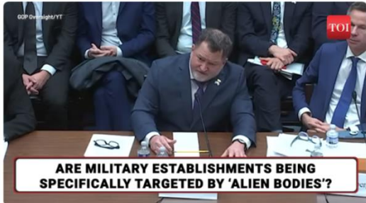
'Alien Bodies Becoming More Provocative': Stunning Revelations By Fmr DOD Official At UAP Hearing

your God." The following quotation gives an interesting perspective on familiar spirits and aliens. "In the days of the Hebrews there was a class of people who claimed, as do the spiritualists of today, to hold communication with the dead. But the 'familiar spirits,' as these visitants from other worlds were called, are declared by the Bible to be 'the spirits of devils.' (Compare Numbers 25:1-3; Psalm 106:28; 1 Corinthians 10:20; Revelation 16:14.) The work of dealing with familiar spirits was pronounced an abomination to the Lord, and was solemnly forbidden under penalty of death. Leviticus 19:31; 20:27." Revelation 16:14 connects these "visitants from other worlds" to last day events, saying, "For they are the spirits of devils, working miracles, which go forth unto the kings of the earth and of the whole world, to gather them to the battle of that great day of God Almighty." Rev 16:14